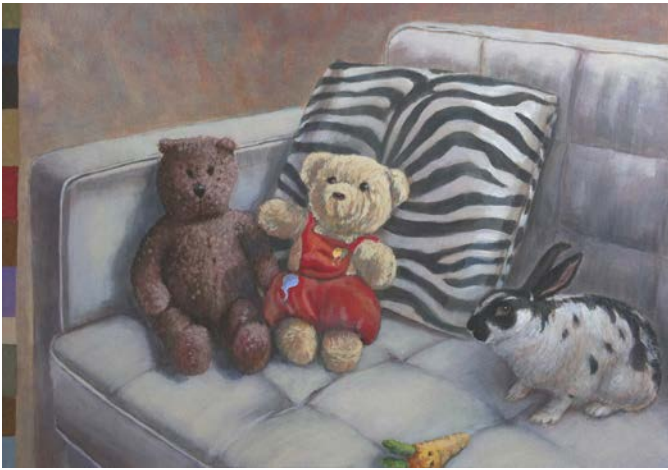
2013-AC2 Teddy Bears & Rabbit april 30x40x2 acrylic on canvas 1495 sale 1395

CATALOG NO. TITLE DATE APPROX H X W X D MEDIA LIST PRICE SALE PRICE*