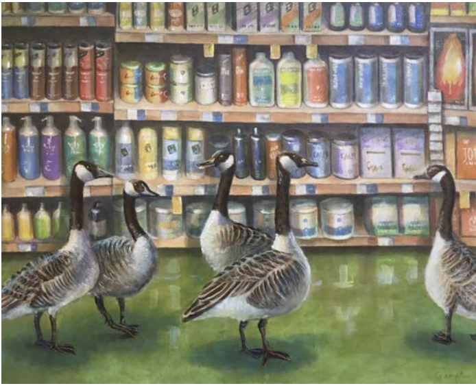
2019-AC3 Geese at Whole Foods 4-9/2017, 2019 40x50x2 acrylic on canvas 2700 sale 2395

CATALOG NO. TITLE DATE APPROX H X W X D MEDIA LIST PRICE SALE PRICE*