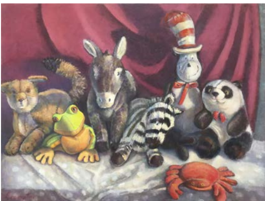
2021-OIL5 Donkey and Friends (red) Sept 40x30x2 oil on canvas 2350