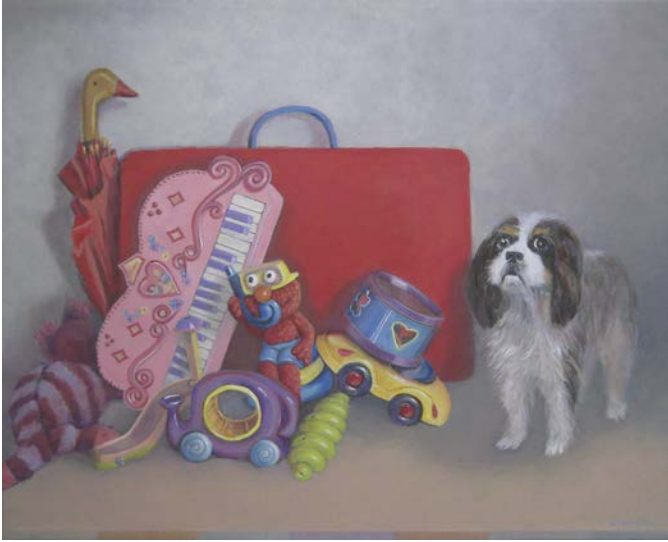
2014-AC1 Spring Break aug 32.5x40.2x1.75 acrylic on canvas includes sturdy frame, cost $350 1895 sale 1795

CATALOG NO. TITLE DATE APPROX H X W X D MEDIA LIST PRICE SALE PRICE*