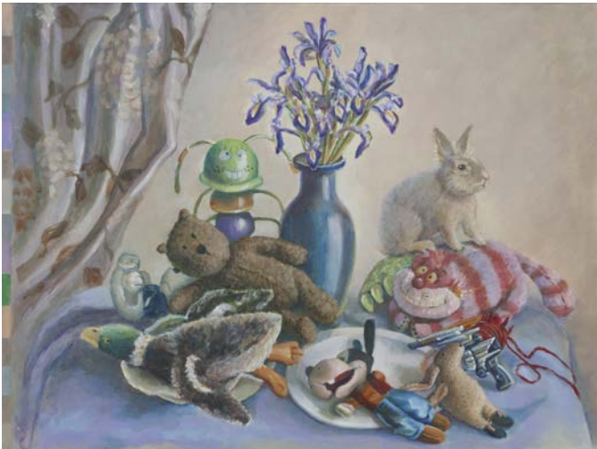
2014-AC4 Toys and Snoopa Thanksgiving 30x40 acrylic on canvas 1495 sale 1395