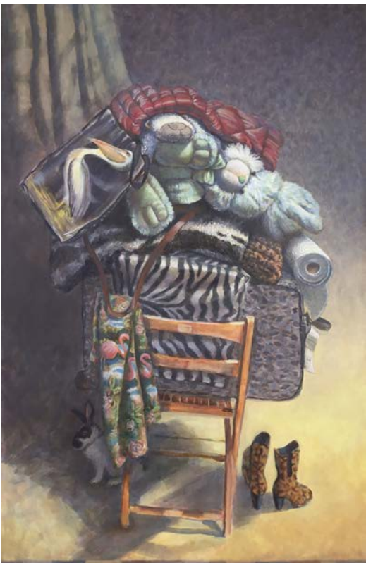
2015-AC3 Faux Fur Madonna

May 72x48x2-5/8 acrylic/paper on canvas 3250. sale 3095