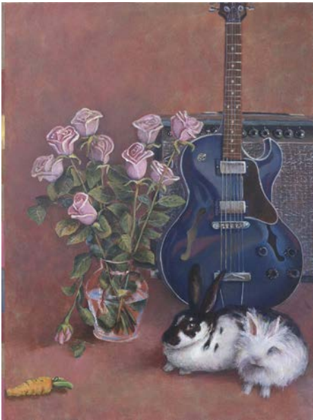
2013-AC1 Roses, guitar & Rabbits