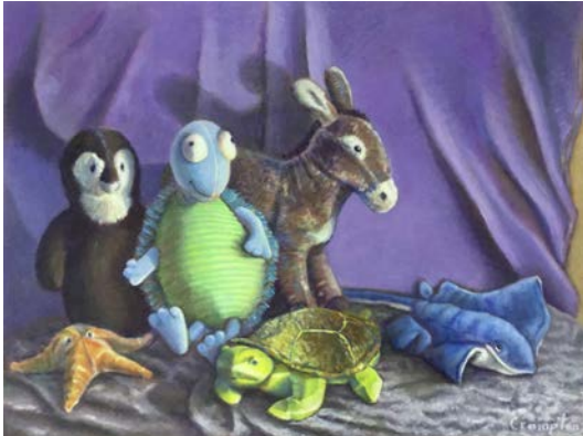
2021-OIL6 Donkey and Tortoise (purple)

CATALOG NO. TITLE DATE APPROX H X W X D MEDIA LIST PRICE SALE PRICE*