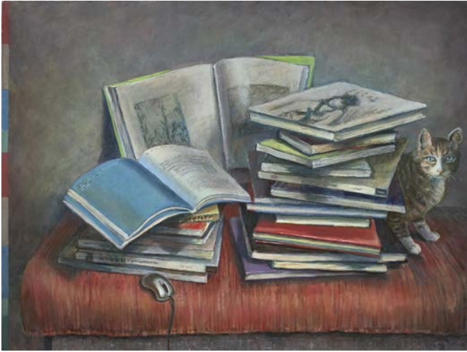
2016-AC3 Books, Cat & Mouse Feb-Apr 30x40 acrylic on canvas 1494 sale 1395

CATALOG NO. TITLE DATE APPROX H X W X D MEDIA LIST PRICE SALE PRICE*