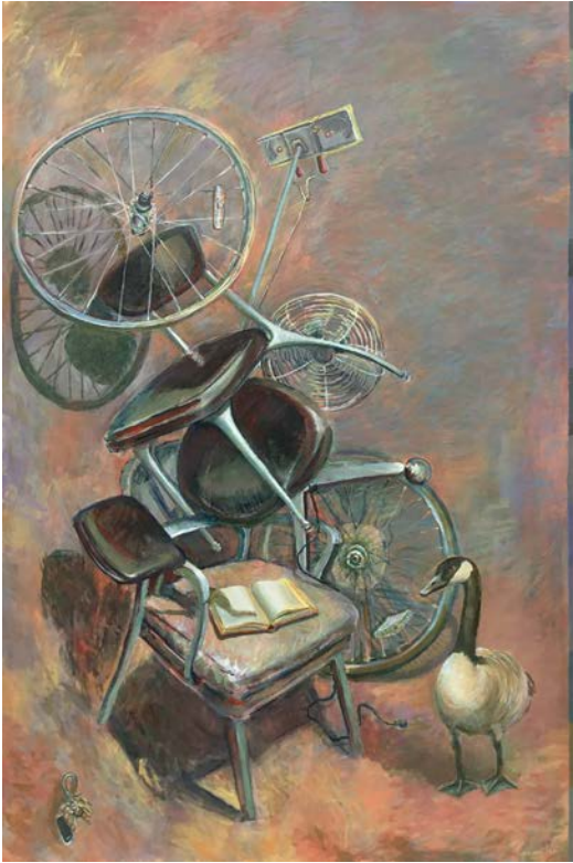
2015-AC2 The Bicycle Madonna

CATALOG NO. TITLE DATE APPROX H X W X D MEDIA LIST PRICE SALE PRICE*