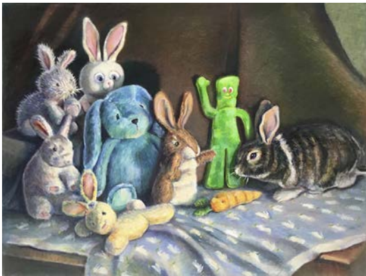
2022-OIL1 Rabbits and George

12/2021 40x30x2 oil on canvas 2350 waiting to find out if it got into the deYoung Exhibit during October