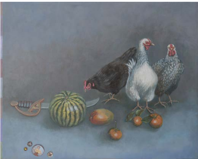
2013-AC4 Hens with Toy Sword, Persimmons, Buttons 32.375x 40x2 acrylic on canvas 1495 sale 1395