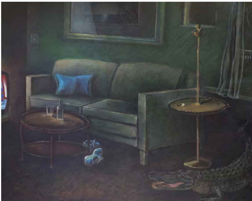
2018-AC3 Room with Alligator dec-feb 60x48x1.75 acrylic on canvas 2899 sale 2795