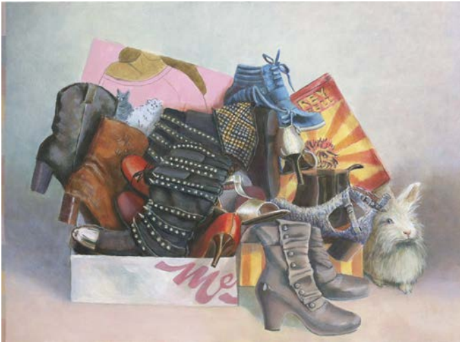
2013-AC3 Pile of Shoes & Rabbit oct 30x40x2 acrylic on canvas 1495 sale 1395