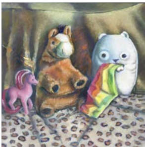
2023-OIL1 Glam w rainbow

2-10/2022 40x30x2 oil on canvas NFS still wet will be 2350