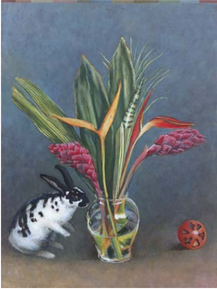
2012-AC8 Flowers with Rabbit

CATALOG NO. TITLE DATE APPROX H X W X D MEDIA LIST PRICE SALE PRICE*