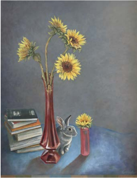
2016-AC7 Sunflowers with Books & Gracie 4/18-7/22 44x34 acrylic on canvas 1395

CATALOG NO. TITLE DATE APPROX H X W X D MEDIA LIST PRICE SALE PRICE*