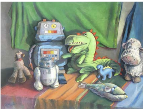
2021-OIL4 Dragon, Computer, StarWars august 30x40x2 oil on canvas over acrylic 2350