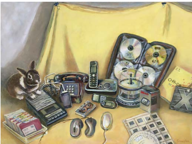
2016-AC10 Old tech with George September 30x40x2 acrylic on canvas 2295 sale 1395