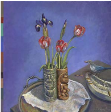
2016-AC8 Tulips with Tiki, baby scrub-jay July 2016 24x24x1 acrylic on canvas no frame needed 820 sale 695