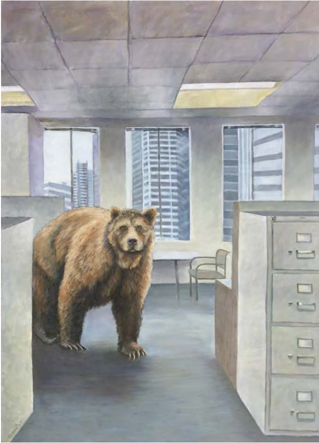
2017-AC7 Bear in office April-Oct 72x52.25x2 acrylic on canvas 3,290 sale 3,095

CATALOG NO. TITLE DATE APPROX H X W X D MEDIA LIST PRICE SALE PRICE*