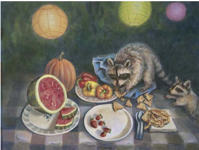
2016-AC4 Raccoons at the Picnic sept2014-2016 30x40 acrylic on canvas $1495 sale 1395